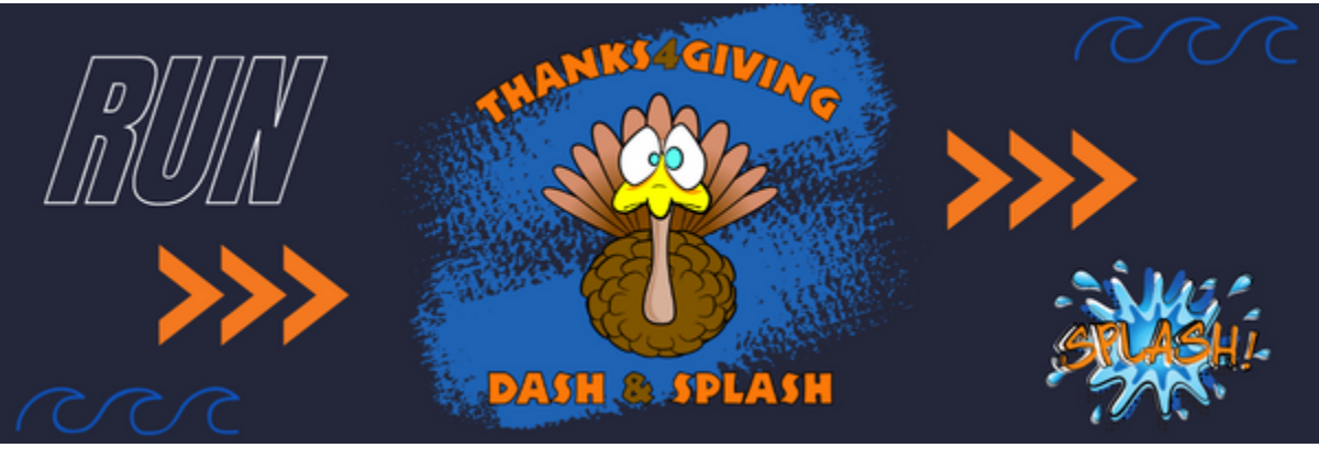
I plan to DASH and/or SPLASH for Special Olympics New Jersey.

That's right! I plan to run a 5K or take a chilly Splash for Special Olympics New Jersey as part of the Thanks4Giving - Turkey Dash & Turkey Splash fundraiser. While I'm excited to participate, I'm also pumped to be able to support a cause I care about.